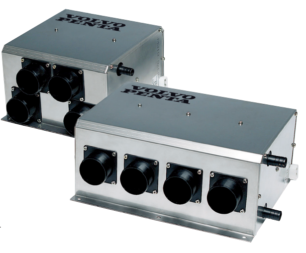
THE VOLVO PENTA AIR HEATER is available in two sizes; 5 kW and 10 kW.

The Volvo Penta air heater utilizes the heat from the engine's cooling system and converts it into hot air. Four outlets makes it easy to distribute the heated air to where it is needed. It gives you a warm and snug atmosphere onboard, and you avoid misty or frosted windows.