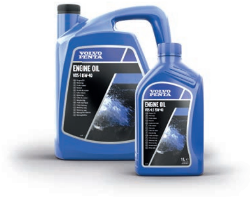
ENGINE OILS PAGE 5

Note! The products displayed in this catalogue are not available in the US.