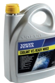
COOLANTS PAGE 8