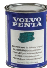
PAINTS PAGE 10